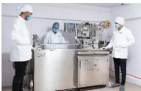
ALU ALU PACKING