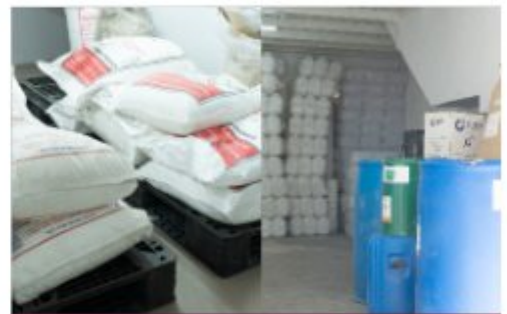
RAW MATERIAL DEPARTMENT